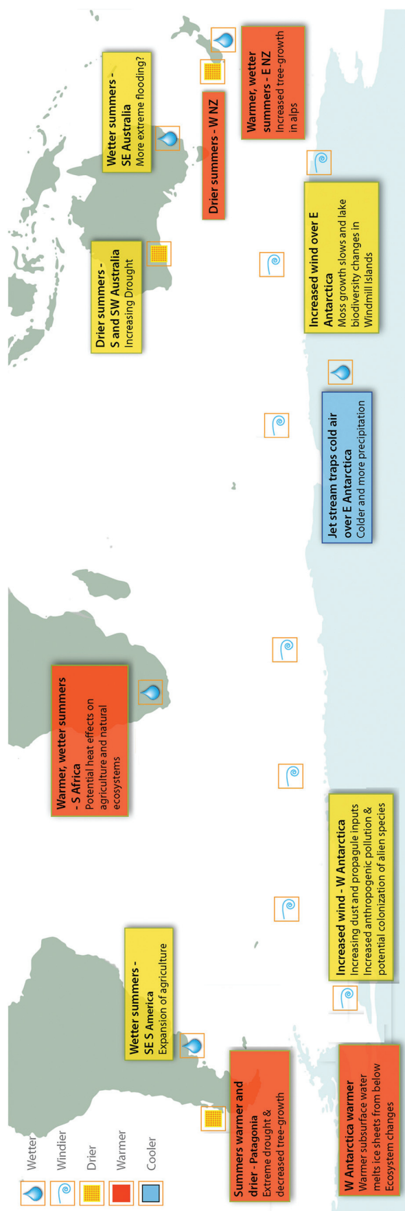
Fig. 2 The Southern Hemisphere showing the impacts of the positive phase of the Southern Annular Mode (SAM) on atmospheric circulation, wind patterns and precipitation, as well as oceanic currents and temperatures. The associated effects of these climate changes on terrestrial ecosystems are shown where available. Over the past century, increasing greenhouse gases and then ozone depletion over Antarctica have both pushed the SAM towards a more positive phase and the SAM index is now at its highest level for at least 1000 years. 67 During the summer months the positive phase of the SAM is strongly associated with ozone depletion. NZ, New Zealand. The figure, produced by Andrew Netherwood, has been modified from Robinson et al. 7