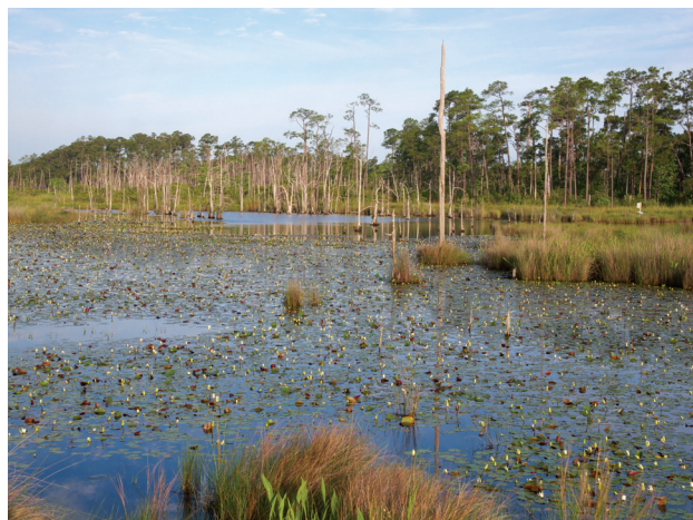
Fig. 1 Wetland ecosystems, such as in south-eastern Louisiana, USA, are important sources of methane and have been the subject of a number of studies examining the effects of UV radiation on methane emissions.

The Southern Hemisphere Annular Mode (SAM), or Antarctic Oscillation, refers to the difference in atmospheric pressure between the mid- and high-latitudes of the Southern Hemisphere and thus the position of the polar jet. When the SAM