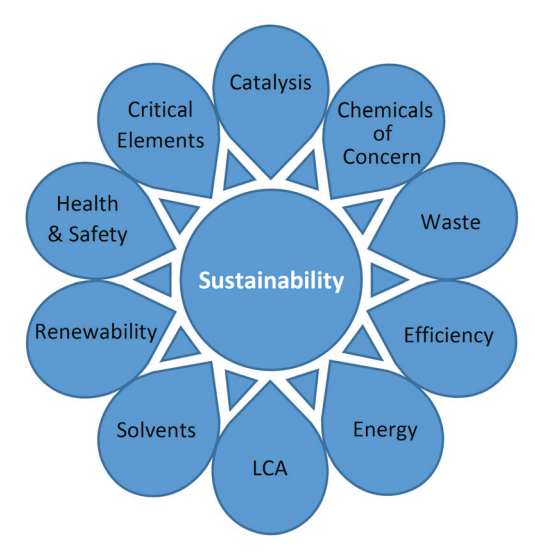
Fig. 1 Summary of the key parameters covered by the metrics toolkit.

A gap analysis was performed to compare current methods against the lifecycle of a typical active pharmaceutical ingredient (API). Subsequently, a number of 'key parameters' were identified which were chosen to cover a comprehensive range of relevant issues regarding the synthesis of chemical products. In this way, the focus was expanded significantly from simply adopting a traditional mass inputs/outputs approach. A summary of the key parameters is shown in Fig. 1. In order to be included in the toolkit, parameters needed to meet the criteria of being able to be practically and consistently measured/ assessed in a laboratory based setting. Following an in-depth critical analysis, favoured quantitative metrics were selected to cover the key parameters. These were supplemented by additional qualitative parameters (where no straightforward calculation is possible).