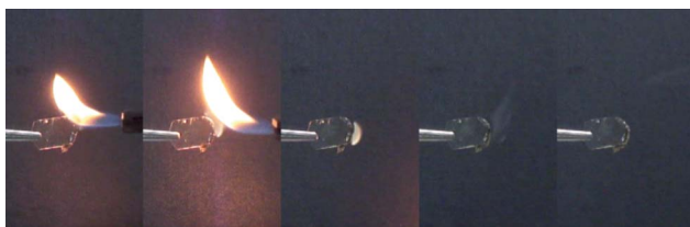
Fig. 4 Flammability of PU prepared by reacting PPDI with the PPC-diol prepared using phenylphosphonic acid as the chain-transfer agent (entry 15). The pictures were taken at 0.8 second intervals from a video clip.

thermograms of poly(propylene carbonate) itself (A) and of PUs prepared by reacting MDI (B and C, entries 9 and 11, respectively) with PPC-diol prepared by feeding 2,6-naphthalenedicarboxylic acid as the chain-transfer agent.