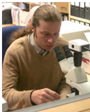
Simon J Coles

† Electronic supplementary information (ESI) available: Datasets and experimental protocols are provided for data collected on the Diamond I19 beamline, the VHF and UHF rotating anode diffractometers and a sealed tube source (image plate) diffractometer are provided. These a) serve as exemplars for data collected at the NCS and b) form the basis for a comparison of the power and capability of the different instruments. CCDC reference numbers 855293–855295. For ESI and crystallographic data in CIF or other electronic format see DOI: 10.1039/c2sc00955b