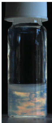
Fig. 2 A concentrated aqueous suspension (approximately 7 \text{ g l}^{-1} ) of cellulose nanocrystals observed between crossed polarizers.

The crystallinity indexes (CI) of the cast films from COX30 and COX60, as well as the reference dissolving pulp, were 68.2%, 74.5%, and 70.9% respectively. It is noteworthy that the