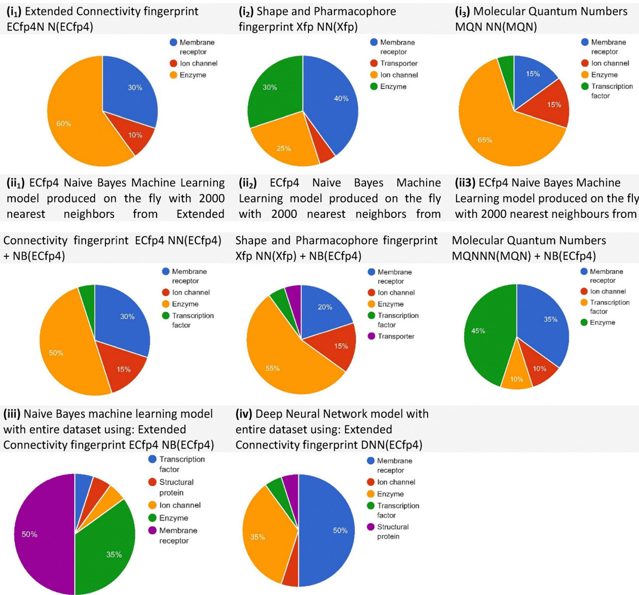
Fig. 2 Predicted target classes displayed as pie charts based on compound–protein target associations in ChEMBL22, using different methods from the polypharmacology browser 2 (PPB2). The methods include: (i) nearest-neighbour search using: extended connectivity fingerprint (ECfp4 NN(ECfp4)), shape and pharmacophore fingerprint (Xfp NN(Xfp)), and molecular quantum numbers (MQN NN(MQN)); (ii) Naive Bayes (NB) models generated on the fly with the 2000 nearest neighbours, combining: ECfp4 NN(ECfp4) + NB(ECfp4), Xfp NN(Xfp) + NB(ECfp4), and MQN NN(MQN) + NB(ECfp4); (iii) Naive Bayes model trained on the entire dataset using ECfp4 (NB(ECfp4)); (iv) deep neural network (DNN) model trained on the entire dataset using ECfp4 (DNN(ECfp4)). Among these, the best-performing methods were ECfp4 NN(ECfp4) + NB(ECfp4) and Xfp NN(Xfp) + NB(ECfp4).

docking may become a more robust tool for target identification and drug discovery. Addressing the key issues of database accessibility, receptor flexibility, and inter-target score normalization will be crucial to realizing its full utility.