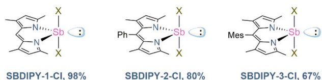
Fig. 2 Isolated SBDIPY complexes.

We next focused on investigating the luminescent properties of these complexes in solution using absorption and emission spectroscopies. The absorption spectrum of SBDIPY-1-Cl