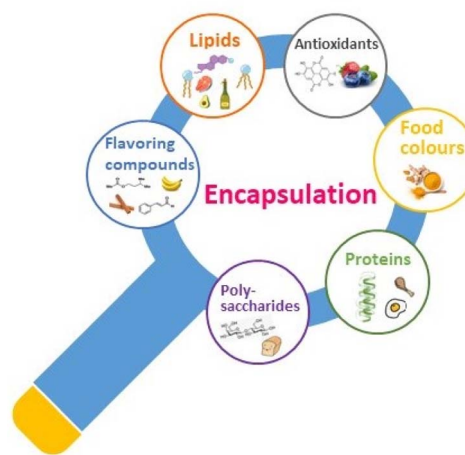
Fig. 3 Encapsulated bioactive compounds targeting enhanced food quality.

Encapsulation is considered a significant method for improving bioactive distribution in food as well as helping in the delivery of bioactives to the gastrointestinal tract. Encapsulation or microencapsulation is actually a method that encloses bioactive molecules either by coating or insertion in