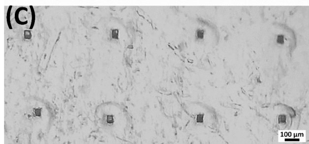
Fig. 5 Insertion test in the Parafilm® skin simulant model. (A) The side length of the pores created by MNs on the first two Parafilm® layers ( n = 10 , mean \pm s.d.). Representative microscopic images of Parafilm® into which FUR-MN2 was inserted: (B) first layer (140 μm), (C) second layer (280 μm). Scale bar 100 μm.

(Fig. 10). The initial burst release of FUR from MNs is from drug that is weakly bound or adsorbed to the surface. 57 The drug release rate increased by incorporating higher initial drug loading. This observation can be attributed to the effect of the drug load on the polymer matrix itself: the smaller relative amount of polymer due to increased drug load may weaken the function of the network as a physical barrier for drug diffusion. In addition, when drug molecules incorporated into the surface of the polymer matrix dissolve into the release medium, they leave pores via which medium can enter the polymer network and facilitate further drug release. 56,58