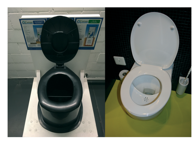
Fig. 1 The Envirosan urine-diverting dehydration toilet (UDDT: left) and the Roediger urine-diverting flush toilet (right).

some popularity as an alternative to conventional dry toilets, especially because they give rise to less odor.<sup>52</sup> In Durban, South Africa, a new law obliged the municipality to provide sanitation to all from 2001, resulting in the installation of double vault UDDTs to serve the areas without sewers.<sup>53</sup> With urine infiltrating the ground and alternate use of the fecescontaining vaults, it was possible to evacuate the vaults in a relatively safe way to gain organic matter for soil improvement. However, whereas Europeans are largely in favor of urine-separating flush toilets, albeit quite critical with respect to the toilet technology available,<sup>51</sup> the UDDTs are not at all popular in Durban.<sup>54</sup> With the flush toilet being the standard solution in the affluent parts of Durban, the affected population considers dry sanitation an unattractive and unjust solution for the poor.55