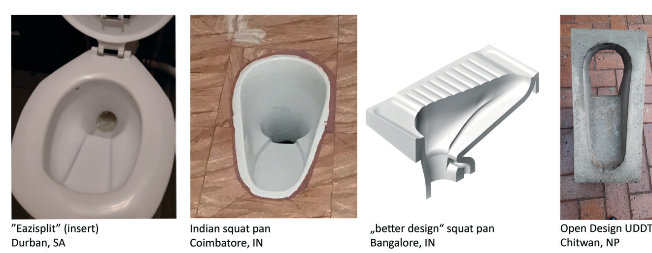
Fig. 4 Examples of the urine trap integration for low-income countries, developed by EOOS NEXT in cooperation with local and global partners. More information in ESI,† Table S2.

in buildings. 57,58,67-69 Introducing urine source-separating technologies into the standard curriculum of architects, plumbers and environmental engineers, as well as developing solid O&M models for on-site urine treatment system should thus be a future focus of development. Increased cooperation between firms, research institutes, authorities and artisans will be needed to develop and quickly diffuse this type of supporting social innovation in the TIS.