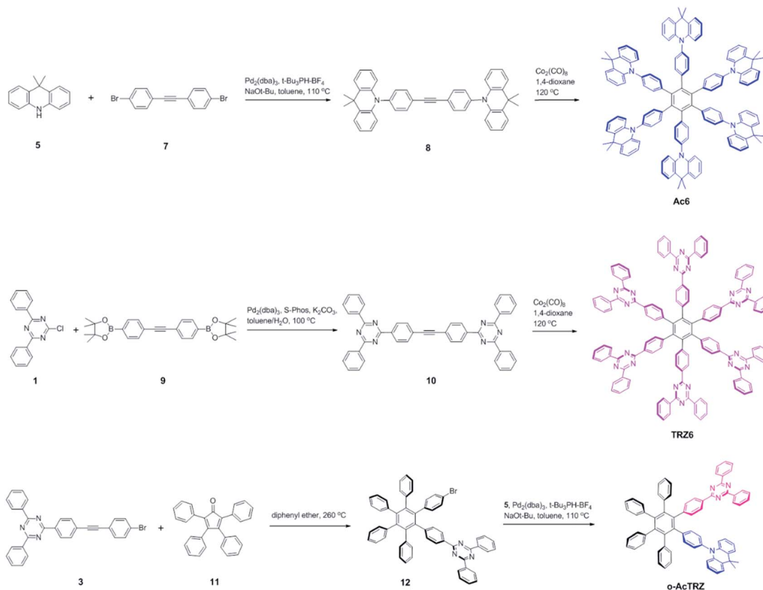
Scheme 2 Synthesis of the control compounds Ac6, TRZ6 and o -AcTRZ.