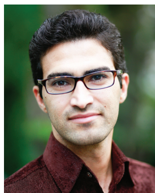
Jamshid Amiri Moghaddam

†Electronic supplementary information (ESI) available: The similarity network file is available at NDEX36 ( https://doi.org/10.18119/N9V31Z ). See DOI: 10.1039/d0ob01677b