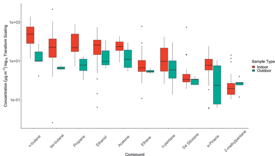
Fig. 3 Rank order plot of the indoor/outdoor ratios for ten most abundant species across both campaigns and all households. The y-axis has been transformed to a \log_{10} scale to aid visualisation.

ten species, only pentane had higher abundance outdoors, which likely reflects its dominant emission from gasoline evaporation and relatively limited use in household products.