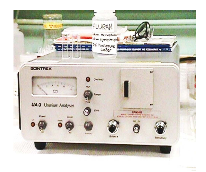
Fig. 1 UA-3 uranium analyzer (SCINTREX, Canada).

cost, simple and direct determination of uranium at \mu g L^{-1} levels in natural water samples for hydro-geochemical reconnaissance surveys for uranium. These are critically evaluated and discussed in depth by Rathore.21