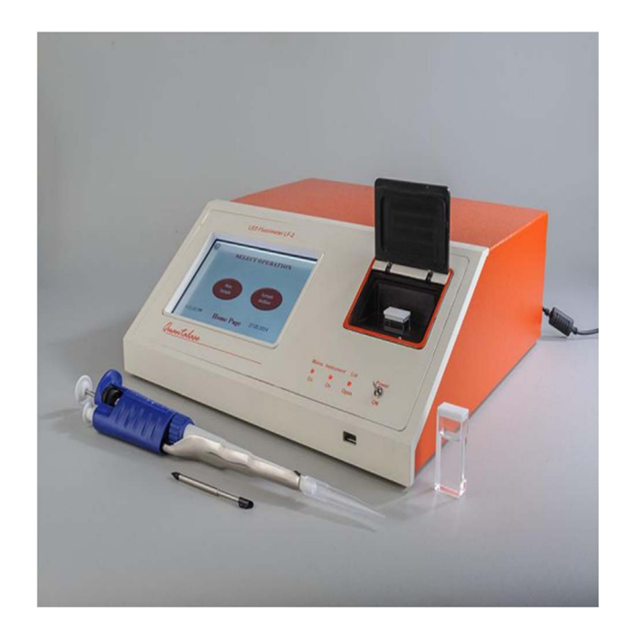
Fig. 2 LED fluorimeter (model LF-2) (QUANTALASE, India)

reconnaissance surveys for field and base laboratory investigations (Fig. 2).