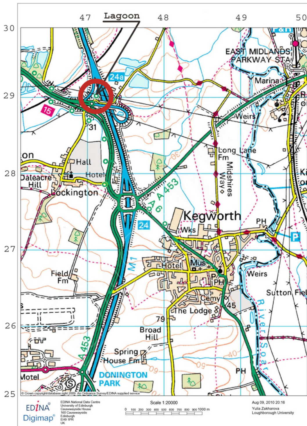
Fig. 1 General view of the M1 (junction 24).

flush. One of the few studies conducted by Sansalone et al. 8 reports on a number of metals (Cd, Zn, Cu and Pb) – dissolved and particulate-bound – which for some events showed a pronounced first flush but for other events showed a weak first flush. We do not want to underestimate the quality of that study, however to enhance its fullness it would