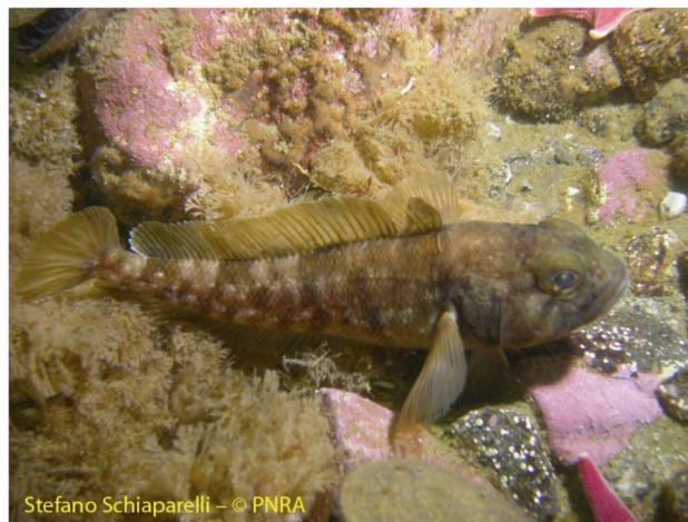
Fig. 3 A specimen of Trematomus bernacchi.

In order to compare with and complement observations in the Arctic, the following discussion focuses on POP temporal trends in marine fish and Adélie penguins. These species are native to Antarctic marine environment and thus suitable to study temporal changes in contaminant exposure in this region. The Tables 1–4 report the concentrations of POPs in the most studied fish and penguin species. Among POPs, we selected PCBs, p,p' -DDT, p,p' -DDE, DDTs, and HCB since other chemicals, including emergent contaminants, were reported only in few articles.