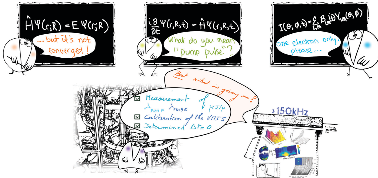
Fig. 2 A Shadoks' view of time-resolved photoelectron spectroscopy for new users: a joint analysis of experimental and theoretical data leads to a quantitative interpretation of the photodynamics.

of the full-dimensional surface is that it enables a level of convergence and quantitative accuracy that is often inaccessible to ab initio on-the-fly approaches.