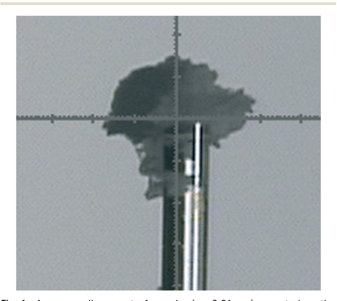
Fig. 1 A very small amount of powder (ca. 0.01 mg) mounted on the top of a glass fibre in the single crystal X-ray diffractometer. Each major tick represents 0.1 mm.

Of the 15 materials studied, 14 (Table 1) were solved to a high degree of accuracy using DASH. Only γ-carbamazepine