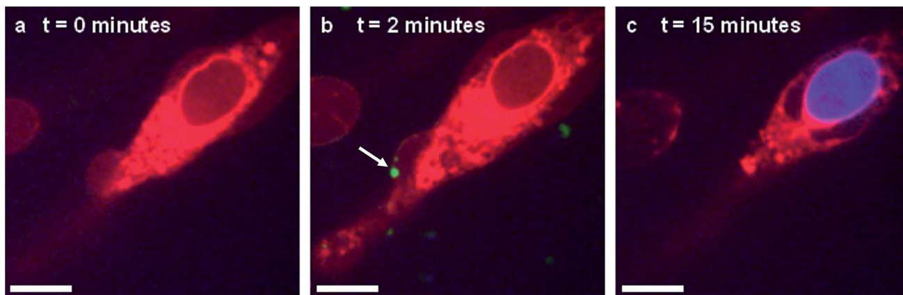
Fig. 4 Live-cell confocal microscopy of coacervate microdroplet–membrane interactions. hMSCs visualised using cytoplasm stain (red) were paintballed using coacervate microdroplets doped with fluorescently-tagged ATP (green) and loaded with Hoechst (blue). These time-lapse images show a hMSC (A) prior to addition of microdroplets, (B) immediately after microdroplet–membrane fusion (denoted with white arrow) and (C) with a stained nucleus, indicating gradual internalisation of the Hoechst payload. Scale bars represent 10 \mu\text{m} .

The effect of paintballing on cell fate was assessed by measuring the viability and multi-lineage differentiation of treated hMSCs. Significantly, Alamar Blue viability assays found no specific cytotoxicity after incubation with up to 100 microdroplets per hMSC, or after the inclusion of the guest species eGFP, ssDNA and Hoechst (ESI Fig. 10†). Post-incubation, the hMSCs continued to proliferate and, importantly, were able to generate differentiated progeny. This was demonstrated through monolayer differentiation experiments, where functionalised hMSCs produced osteoblasts, with visible calcium phosphate deposits, and adipocytes, possessing lipid vacuoles (ESI Fig. 11†). This is a significant result, as it demonstrates that the microdroplet–membrane interactions do not affect the therapeutic utility of the functionalised stem cells.