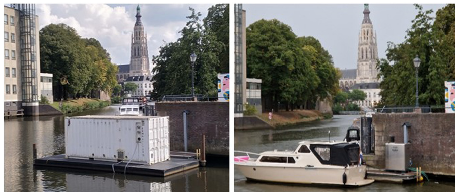
Fig. 2 Pictures of monitoring location BACT 1. Left: Monitoring container in 2020. Right: Monitoring set-up in 2022.

400 CFU/100 ml for int. enterococci . Additionally, a manual for water recreation and water events in the Netherlands has been developed, 25 in order to facilitate water recreation at unofficial bathing locations. The manual uses the same signal value for individual samples for E. coli at 1800 CFU/100 ml. Hence, while the Directive focuses on the assessment of the average water quality, the Dutch guidelines refer to individual measurements.