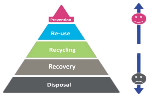
Fig. 18 The waste management hierarchy and range of recycling options. 158