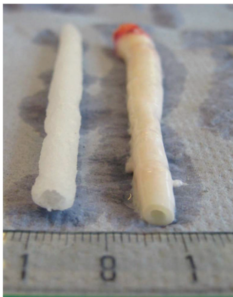
Fig. 15 Porous scaffold (left) synthesised from cross-linked P4 and porcine carotid artery (right). 89 Reprinted from ref. 89, Copyright 2020, with permission from Elsevier.

tron beam irradiation doses, between 30 and 500 kGy. The resins are shown to degrade via enzymatic hydrolysis and subsequent surface erosion, a degradation mode resembling that of crystalline PHA. 92