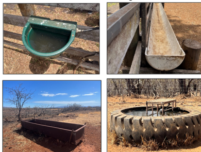
Fig. 3 Some agricultural water system assets were thermally damaged, destroyed, or impacted by particulate.

An underground fire was found during the field investigation.