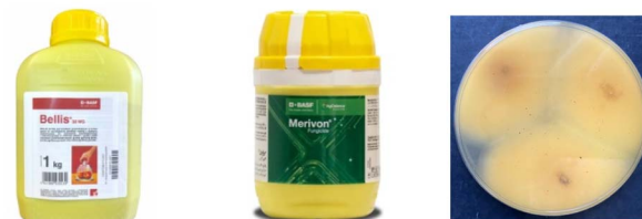
Fig. 4 Inhibition of growth of Aspergillus niger (strain VURV-F 822; measured as a diameter of the inhibition zone, mm) with boscalid, bixafen, fluxapyroxad, and their analogs 28–30 at different concentrations after 48 h of incubation. Fungicides boscalid (@Bellis) and bixafen (@Merivon) are shown. Inhibition of fungal growth by compound 29.

Lipophilicity. To estimate the influence of the replacement of the ortho -benzene ring with bicyclo[2.1.1]hexane on lipophilicity, we used two parameters: calculated lipophilicity (clogP) 27 and experimental lipophilicity (logD).