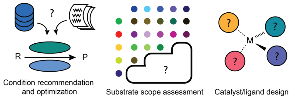
Fig. 4 Overview of key reaction development tasks. Condition recommendation and optimization models can be built based on existing literature and electronic lab notebook data. Substrate scope assessment models have so far mainly been designed based on high-throughput experimentation results, where combinations of two or more reactant types are tested exhaustively. Catalyst/ligand design has been approached either through exhaustive screening campaigns, where ligand combinations are exhaustively enumerated from a library, or through generative modelling in recent years.