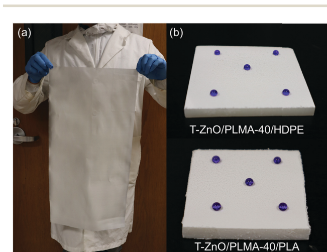
Fig. 7 Photographs of (a) a large size (30 × 60 cm) T-ZnO/PLMA-40 coated mesh; and (b) T-ZnO/PLMA-40 coated HDPE and PLA sheets with dyed blue water droplets.

The authors gratefully acknowledge the Robert A. Welch Foundation (A-1898) and Texas A&M Triads for Transformation (T3) from President's Excellence Fund for finance support of this work. LD, NRG, and SB acknowledge partial support from the National Science Foundation under IIP 2122604.