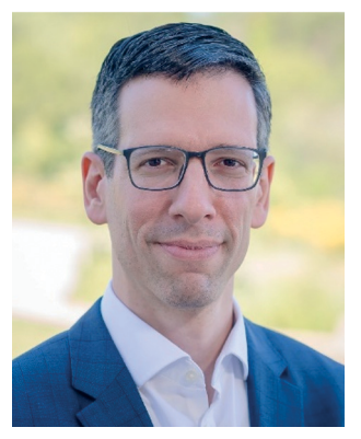
Seth B. Darling

et al. (DOI: 10.1039/C9ME00160C) and the mini-review by Yang, Darling et al. 10.1039/C9ME00154A). Phillip develop a hollow nanofiltration membrane from the microphase separation of a designed copolymer followed by cross-linking. The membrane with nanopores delivers both high flux and rejection of divalent cations after surface functionalization positively charged moieties, presenting a good example of how molecular and interfacial engineering impart tailored separation performance. The mini-review by Yang, Darling and co-workers summarizes the