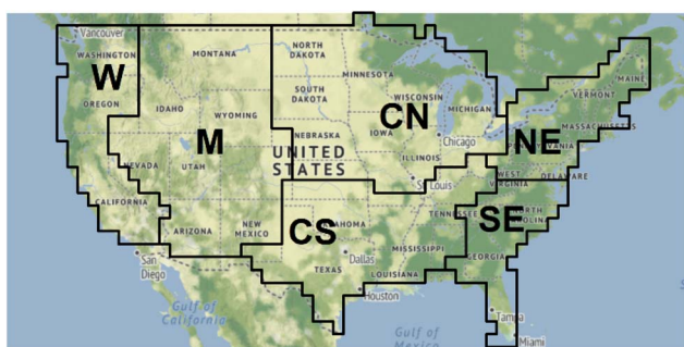
Fig. 2 Regions in the U.S.: northeast (NE), southeast (SE), central north (CN), central south (CS), mountain (M), west (W), as defined by (ref. 44). The figure was generated using R package ggmap 45 and ggplot2. 46