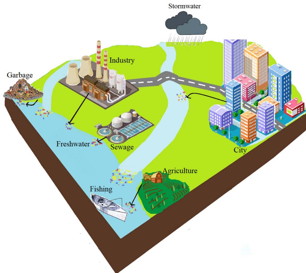
Fig. 1 Anthropogenic parameters affecting microplastics (MP) abundance in freshwater environment.

food resource, including the Chi River, Thailand. 6 In the study of MP abundance in three Gogian dams, the abundance of fibers was assumed to be related to fishing ropes and nets. 16