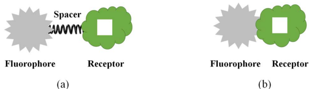
Fig. 3 Fluorescent sensor model (a) with and (b) without a spacer.

When the analyte binds to the guest acceptor, the photophysical properties of the sensor change through mechanisms such as photo-induced electron transfer (PET), intramolecular charge transfer (ICT), fluorescence resonance energy transfer (FRET), etc. 67–69