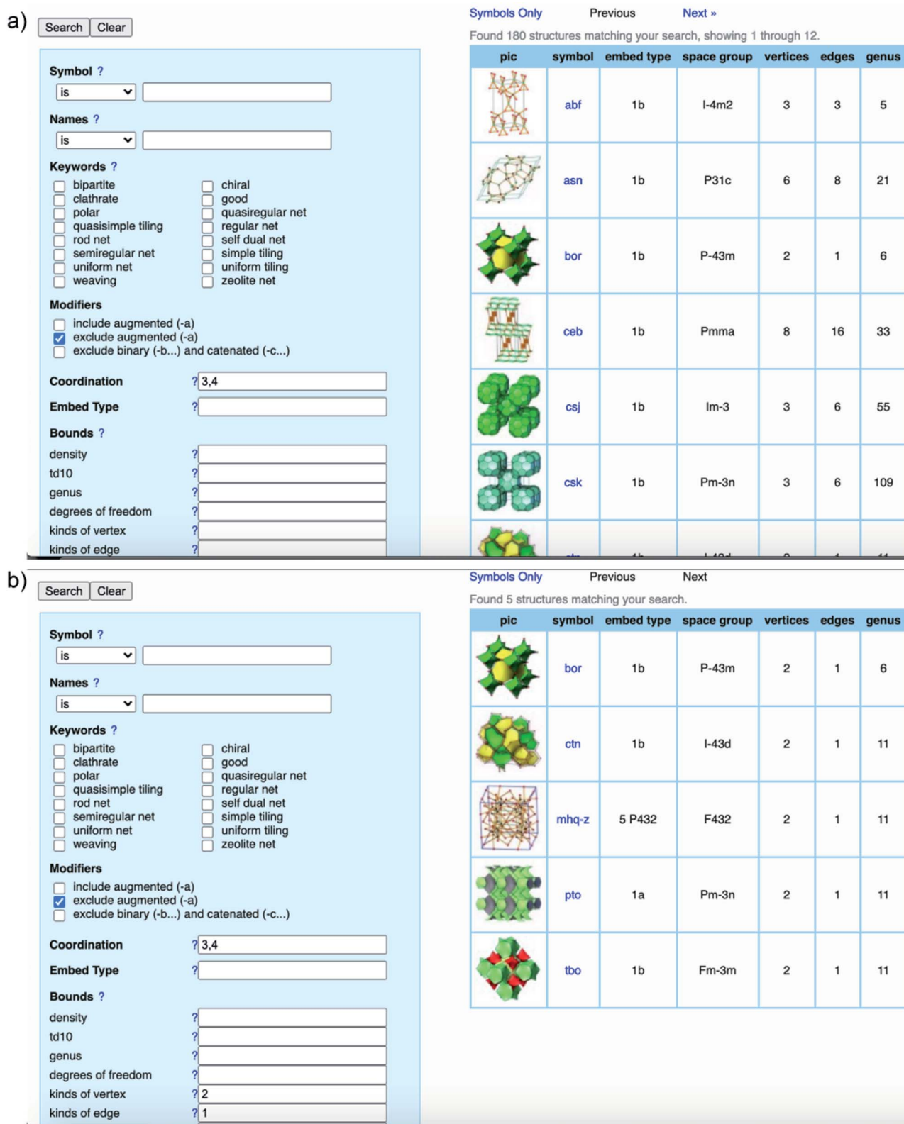
Fig. 5 Heuristic process of finding bor and ctn topologies through the RCSR database. General search using 3,4-coordinate SBUs results in 180 possible topologies (a) and minimizing the possibilities by introducing kinds of vertices and edges (b). The search was conducted on November 10, 2020.