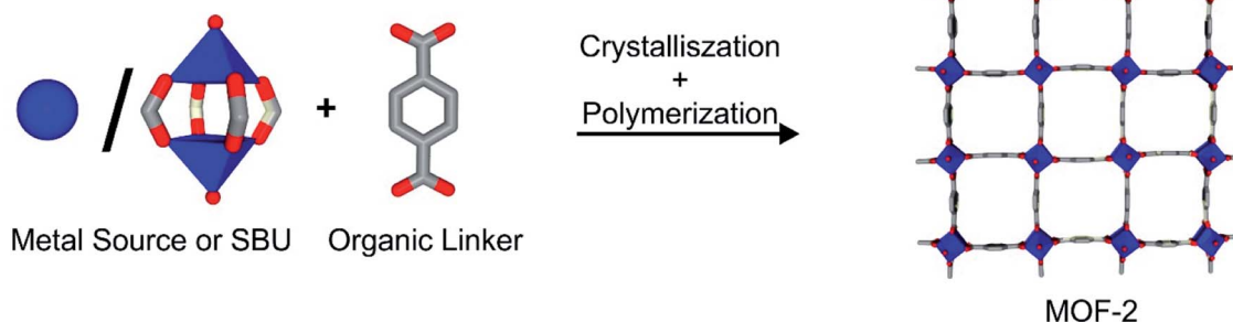
Fig. 1 (a) Schematic depiction of a range of conventional 2D materials. (b) 2D framework materials, their building blocks and synthetic procedures: (i) 2D polymers, (ii) 2D covalent-organic frameworks and (iii) 2D metal-organic frameworks.

Very recently, a surfactant-monolayer-assisted interfacial synthesis (SMAIS) method has been developed for the preparation of few-layer 2D polyimide and 2D polyamide crystals on the water surface (Fig. 3a), 38 through reaction between amine