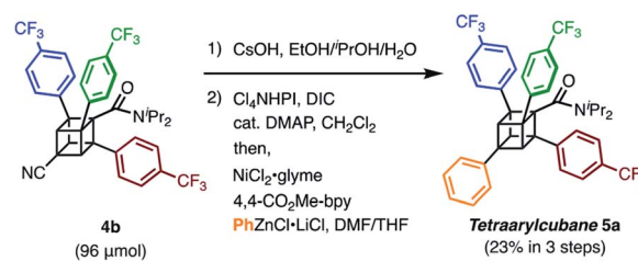
Scheme 4 The synthesis of tetraarylcubane 5a .

framework, indicating that the cubyllithium zincate was not generated from 2b (Scheme 2b). In a multiple iodination reaction of a cyanocubane derivative reported by Eaton, enhanced acidity of cubane was the key for multiple functionalization. 17 Following this principle, cyanocubane-amide 1b' was synthesized and utilized for multiple arylation (Scheme 2c). While the reaction of 1b' at 25 °C (Condition A) resulted in a low yield of 2b' , the metalation of 1b' at low temperature (−78 °C to 0 °C, Condition B) followed by arylation at 25 °C afforded 2b' in 68% yield. Notably, 2b' can be obtained even on a gram scale (1.1 g). The conditions used for the arylation of 1b' also enabled the arylation of 2b' to give diarylcubane 3a in excellent yield (73%). The structure of 3a was confirmed by X-ray crystal structure analysis, which proved the regioselectivity of the second aryl group (Fig. S6†). Iodoarenes with bromo and ester groups, as well as idonaphthalenes, reacted well to give the corresponding diarylcubanes 3b–3f . The second arylation reaction took place regioselectively at the C–H bonds near the amido group, demonstrating that the aryl-installing positions are predictable and programmable. It is notable that the diarylcubanes are chiral cubanes, which are a few cubane derivatives. 8a,18 The racemic products 3a and 3f were separated with a chiral column to afford the chiral molecules (Fig. S9 and S10†).