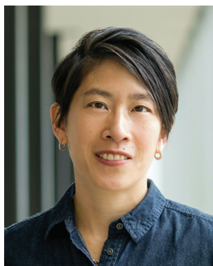
Teri W. Odom

This Mini-review discusses advances in reconfigurable wrinkles enabled by soft skin layers. First, we review solution processing techniques that can form polymer skin materials. Compared to conventional systems based on stiffer skin layers, cracking is greatly suppressed when the wrinkle orientation is switched under tensile strain. We then introduce plasma processes that can access accurate thicknesses of the soft skin layers needed to control the wrinkle wavelength both in nano- and micrometer regimes. Finally, we describe how soft skin layers can be used to pattern thin functional materials such as graphene and other 2D nanomaterials with customizable feature sizes and structural hierarchy.