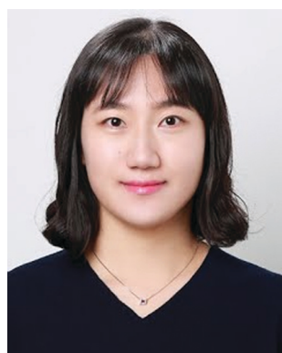
Yun Jeong Hwang

However, the HAADF-STEM technique has a limitation of only showing the local information of the sample at a nano-scale which is not representative of the whole area of the sample. Meanwhile, the other widely used analytical method is the extended X-ray absorption fine structure (EXAFS) technique, which obtains representative coordination properties of a large area of the catalyst. Fourier-transformed (FT) EXAFS spectra provide information on interatomic distances and coordination numbers which can determine the single-atom morphology. The X-ray absorption near-edge spectroscopy (XANES) spectra and the FT EXAFS spectra at the Ni K-edge are used to verify the chemical state and coordination environment of the single-atom Ni in the A-Ni@DG catalyst. In the XANES spectra, the Ni@DG exhibits similar white line peaks with Ni foil, suggesting the presence of metallic Ni nanoparticles. Meanwhile, A-Ni@DG shows a higher white line peak than Ni@DG, indicating the oxidized electronic structure of the single-atom Ni owing to the presence of the Ni–C 4 structure.