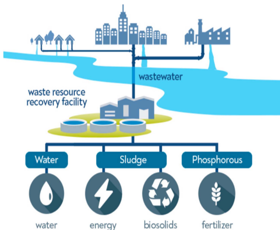
Fig. 1 Stages and applications of wastewater treatment (ref. 36).

Conventional techniques for treating wastewater, such as preliminary, primary, secondary, and tertiary treatment, are commonly used to remove pollutants from wastewater. 34 These approaches serve the common goal of mitigating diverse contaminants including heavy metals, inorganic metallic materials, organic matter, residues from disinfection, and microbiological chemicals present in wastewater. 35 Some applications of treated wastewater are shown in Fig. 1.