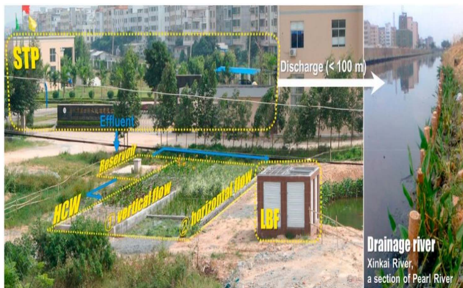
Fig. 21 Layout of the full-scale system for purifying STP discharge ref. 190.

as pH and organic matter. While much focus has been on photocatalysis, there is increasing interest in their broader applications, offering both challenges and opportunities for future developments.