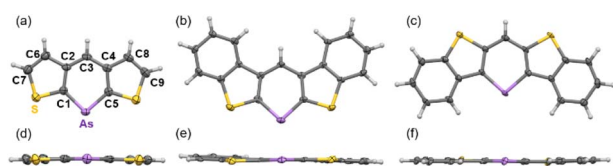
Fig. 2 ORTEP of (a and d) 3a , (b and e) 3c , and (c and f) 3d . Thermal ellipsoids are drawn at the 50% probability level.