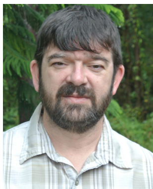
Vladimir N. Uversky

In the comprehensive review, Ernst et al. 27 emphasized: “While all of the known structures of microbial rhodopsins show a common tight \alpha -helical bundle of 7TM helices surrounding the retinal chromophore, there is substantial variation in the arrangement of side chains, the structure of the