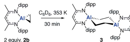
Scheme 2 Non-reversible dimerization of 2b to form 3 .

Heating 2c , in the presence of excess alkene, at 353 K in \text{C}_6\text{D}_6 led to the loss of the dark orange colour and formation of the