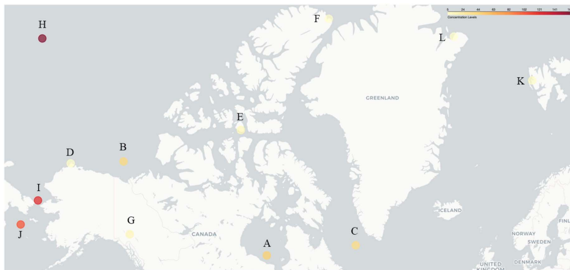
Fig. 3 Atmospheric concentrations of 8 : 2 FTOH ( \text{pg m}^{-3} ) in the Arctic, as reported in prior studies. 20,26,49,52–54 Measurements in the following locations are reported: (A) Hudson Bay, (B and D) Beaufort Sea, (C) Labrador Sea, (E) Cornwallis Island, (F) Canadian Arctic Alert, (G) Little Fox Lake, (H) High Arctic Ocean, (I) Chukchi Sea, (J) Bering Sea, (K) Ny-Ålesund, (L) Villum Research Station.

For 8 : 2 FTOH, concentrations were 6.41 \text{ pg m}^{-3} in Alert and 16.1 \text{ pg m}^{-3} in Little Fox Lake, identified in Fig. 3 as points F and G, respectively. 54 The levels of FOSEs and PFOSA derivatives were below the LOQ in both locations. Such low levels of 10 : 2 FTOH, 6 : 2 FTOH, FOSEs and PFOSA derivatives might reflect lower atmospheric prevalence in the studied region, whereas the elevated levels of 8 : 2 FTOH could reveal its common use and greater environmental persistence. Further research is critical to study and analyze PFAS contamination in the Canadian Arctic, with emphasis on identifying emission sources and transport pathways. Expanding analytical datasets in this region would be significant to understand the LRAT of neutral PFAS and their presence in polar ecosystems.