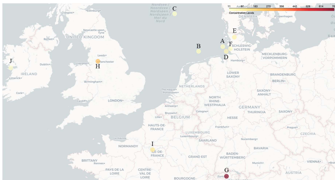
Fig. 6 Atmospheric concentrations of 8 : 2 FTOH ( \text{pg m}^{-3} ) in selected regions in Europe, as reported in prior studies. 61,83–87 Measurements in the following locations are reported: (A) German Bight, (B) Heligoland, (C) West Frisian coast, (D) Cuxhaven, (E) Schleswig-Holstein, (F) Büsum, (G) Zurich, (H) Manchester, (I) Paris, (J) Mace Head.

Furthermore, the German coastline features multiple industrial and port facilities, including those in Hamburg,