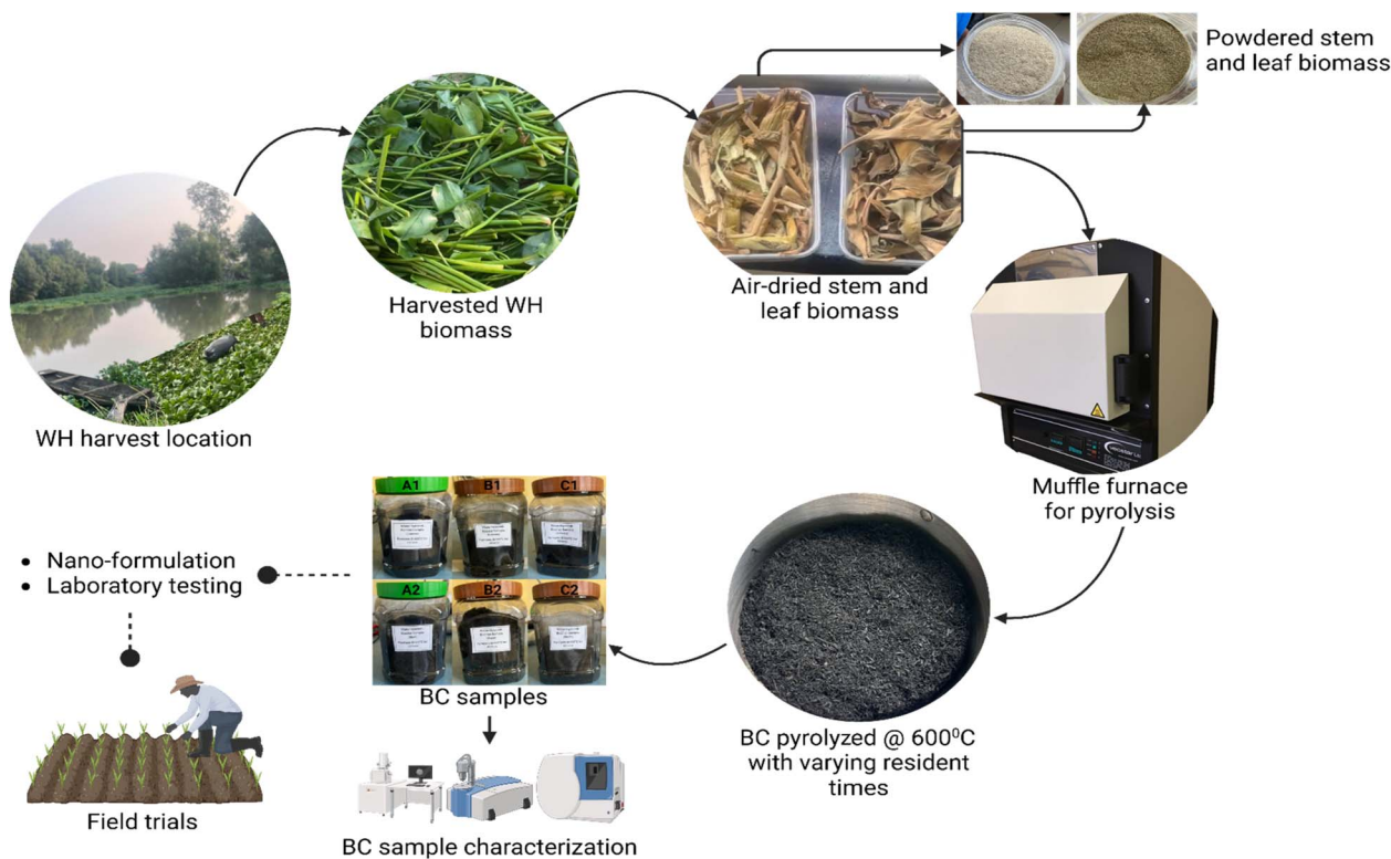
Fig. 1 Process summary for WH upcycling to produce BC for nano-enabled biofertilizer formulation.

samples were cleaned and separated into leaf and stem biomasses. Air-drying was carried out at ambient atmospheric conditions: temperature 30 °C, humidity 71%, and atmospheric pressure of 29.84 inHg until samples were dried to a consistent weight. The dry biomass was used in pyrolysis.