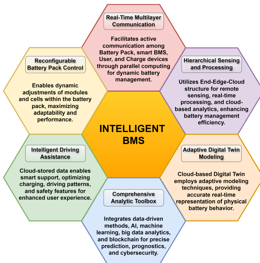
Fig. 5 Key features of the proposed intelligent battery management system (IBMS).

Moreover, the system incorporates a comprehensive analytical toolbox that combines data-driven and model-based methods, AI, machine learning, big data analytics, and blockchain technology to ensure precise predictions, prognostics, and cybersecurity for large-scale battery systems. Intelligent driving assistance is provided through cloud-stored data,