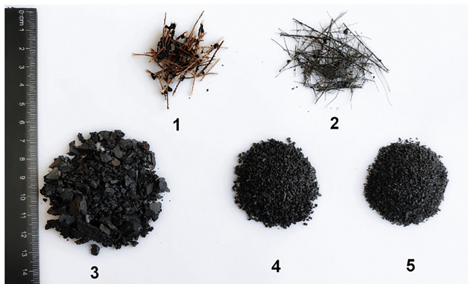
Fig. 2 Typical products of cryogrinding. 1 – nylon cord, 2 – metal cord, 3 – large size fraction of rubber crumb (1–5 mm), 4 – mean size fraction (1–2 mm), 5 – small size fraction (0.1–1 mm). Reproduced from ref. 7.

product of cryogrinding. 7 After grinding, steel wires and textile fibers embedded in the tire are separated using magnetic separators and air classifiers. This ensures a cleaner final product and allows for the recovery of steel fibers, which can be repurposed in construction materials. The resulting crumb rubber finds a wide range of applications across industries. It is commonly used in rubber-modified asphalt, enhancing the durability and flexibility of pavement surface layers. Other uses include flooring materials, mats, playground surfaces, athletic tracks, and molded rubber products like tiles and protective padding. 8