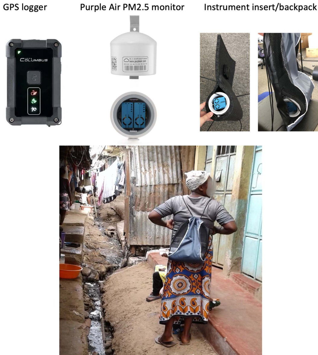
Fig. 1 Instruments used in this study. From top left to right, the Columbus P-1 GPS logger, PurpleAir PA-II-SD, the foam pad used to affix the PurpleAir for insertion into a sampling pack, the mesh-sided backpack used to hold the instrumentation; and shown deployed in the lower panel.

consideration was given to ensuring that the equipment was discrete, which meant that conspicuous placement of the instrumentation nearer the breathing zone was not practical.