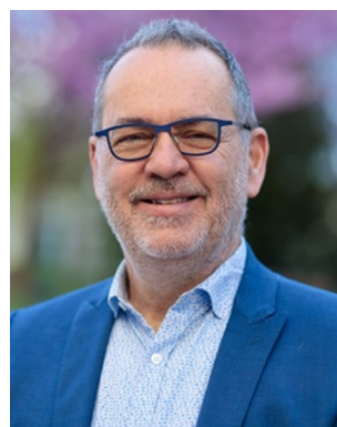
Jeffrey A. Hubbell

dynamic covalent polymers, self-healing materials, responsive adhesives, sustainable plastics, nanocellulose, polymers for battery applications, biomaterials and developing new synthetic methods for the construction of complex polymeric architectures.