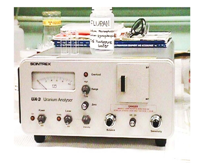
Fig. 1 UA-3 uranium analyzer (SCINTREX, Canada).

cost, simple and direct determination of uranium at \mu g~L^{-1} levels in natural water samples for hydro-geochemical reconnaissance surveys for uranium. These are critically evaluated and discussed in depth by Rathore.<sup>21</sup>