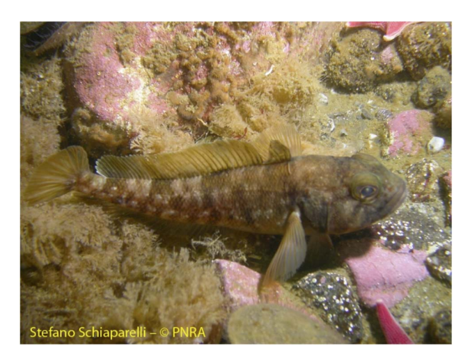
Fig. 3 A specimens of Trematomus bernacchi.

In order to compare with and complement observations in the Arctic, the following discussion focuses on POP temporal trends in marine fish and Adèlie penguins. These species are native to Antarctic marine environment and thus suitable to study temporal changes in contaminant exposure in this region. The Tables 1–4 report the concentrations of POPs in the most studied fish and penguin species. Among POPs, we selected PCBs, p_sp' -DDT, p_sp' -DDE, DDTs, and HCB since other chemicals, including emergent contaminants, were reported only in few articles.