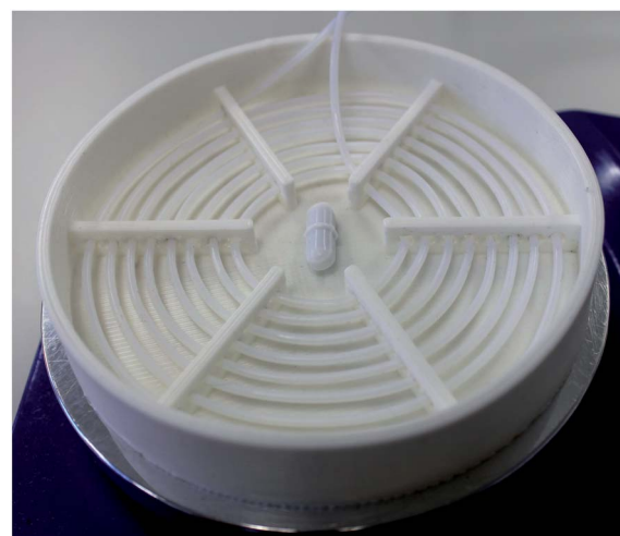
Fig. 3 Photograph of a 3D-printed oil bath with integrated mounting holes for holding PTFE tubing in a fixed spiral arrangement.