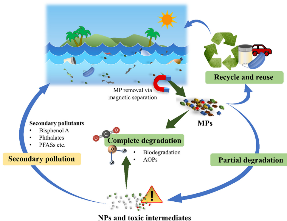
Fig. 4 Fate of MPs post magnetic separation. Possible outcomes include complete degradation, partial breakdown to NPs, secondary pollution, or recycling and reuse.