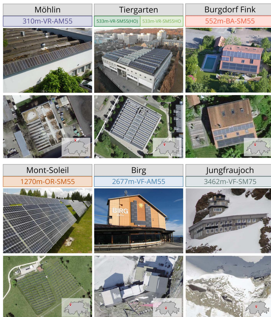
Fig. 2 System photos, showing the profile view (top) and aerial view (bottom). Approximate location in Switzerland is indicated in the bottom right corner. The Tiergarten system is separated in the East and West parts of the rooftop in the data and results. Site IDs are indicated below the system name, following the defined format: [Altitude]-[Mounting Config.]-[Module Type], see Table 1.